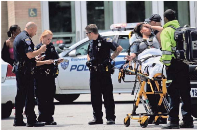
A student is taken to a waiting ambulance after a large fight broke out at East High School during a fire alarm.