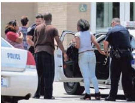
A student is released from custody after a large fight broke out at East High School during a fire alarm.